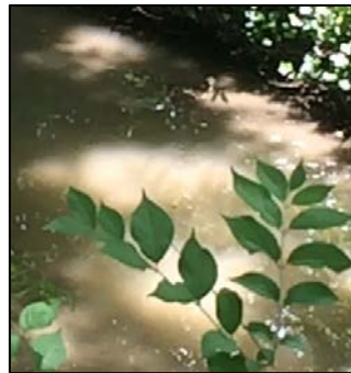
Discoloration Can Indicate Toxins