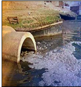
Sewage Spill May be Manhole Leak Threat to health & recreation