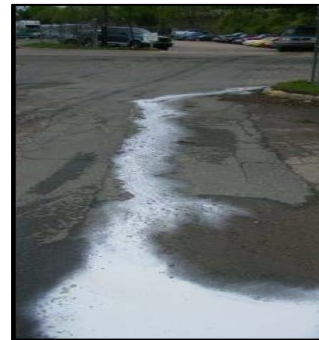
Paint Any Color. Kills Fish

After 5 pm or a weekend also call the Park Police 301-949-3010