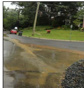
Muddy Runoff Suffocates Stream Life