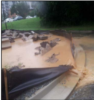
Construction Site Silt Fence Failure Sediment Kills Aquatic life