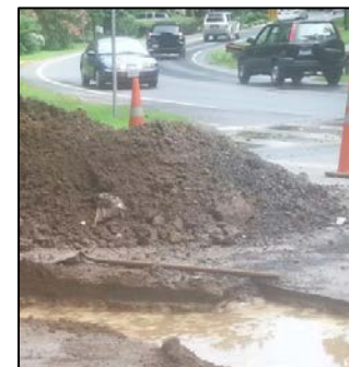
Exposed Soil Can Create Muddy Runoff