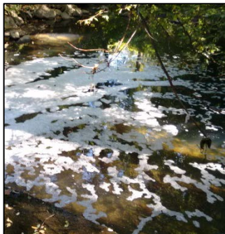
Suds, Foam, Bubbles Unnatural: Odor, Sheen