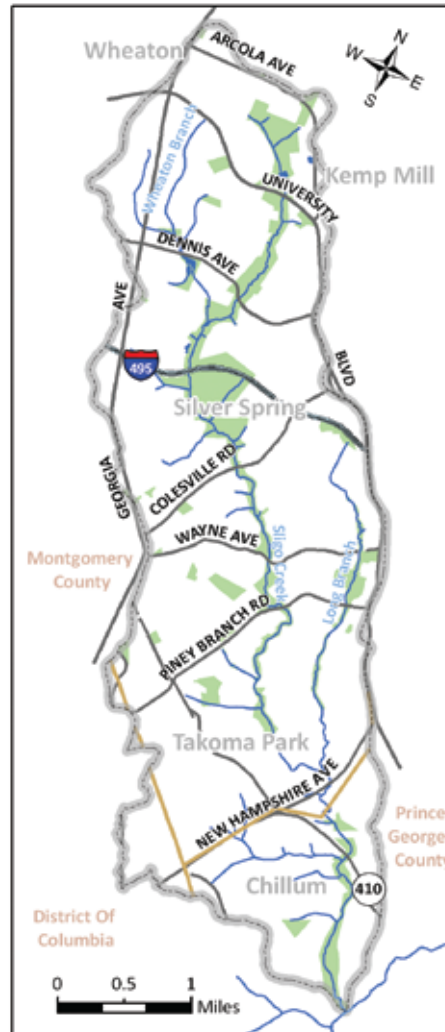
For more photos, visit www.fosc.org.